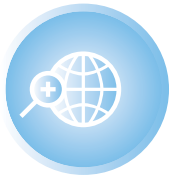
MOTOTRBO Location Services